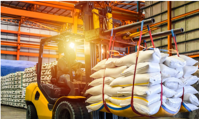
Warehouse Operator, using a forklift to move bags of sugar for export.