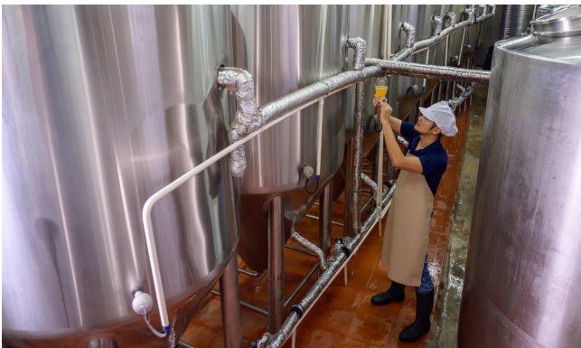
Food Process Worker at a craft brewery, checking product quality.