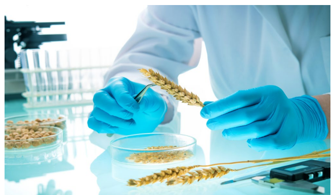
Food Technologist inspecting grains.

Images in this document have been supplied by Manufacturing Skills Queensland and industry partners. Additional images have been sourced through Adobe Stock or generated using Adobe and Google AI software. Design layout by Liveworm, Queensland College of Art and Design, Griffith University.