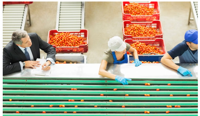
Process Workers and a production manager at a tomato processing plant.