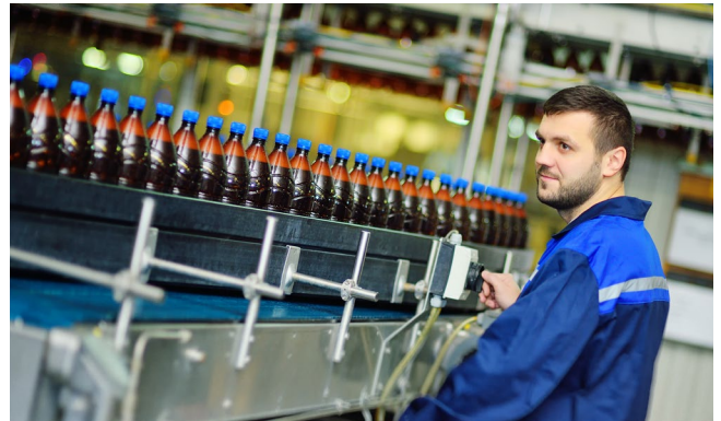
Process Worker at a carbonated drink manufacturer overseeing bottles on the conveyor belt.