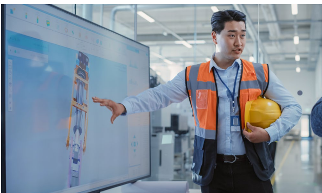
Project Engineer coordinating the project, ensuring timelines are met.