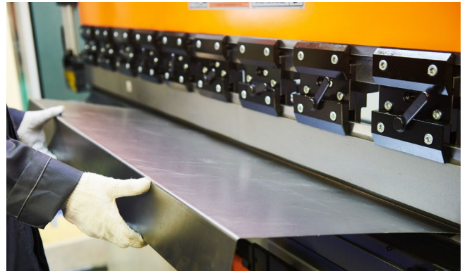
Metal Engineering Process Worker operating a hydraulic steel plate bending machine.