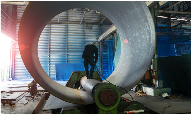
Boilermaker roll bending a large sheet of steel.