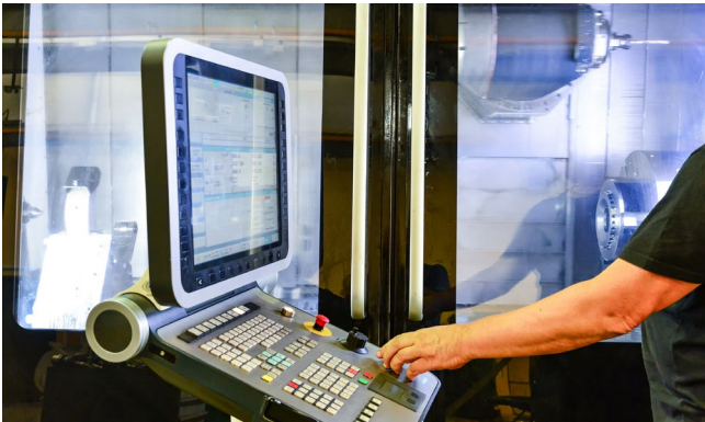
Machine Operator at the control panel, operating a high-precision Computer-Numerical Control (CNC) machine.