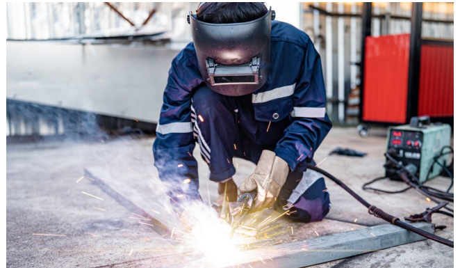
Welding Supervisor welding two metal sections.