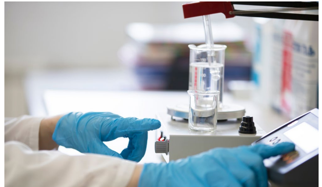
Chemical Technician developing new products.