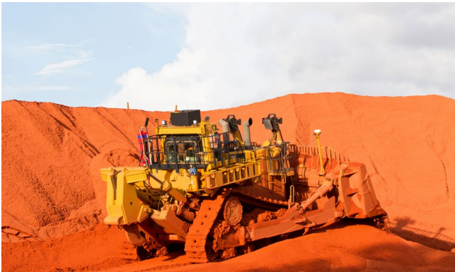
Mining Bauxite in Weipa, Queensland. Bauxite is an aluminium ore and is used across many industries to make anything from a soft drink can to aircraft.