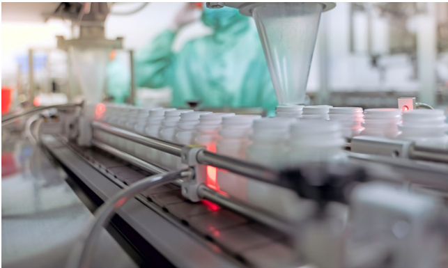
Pharmaceutical Technician overseeing the transfer of medicine to bottles on a conveyor belt.