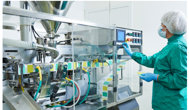
Mass production of healthcare labels for use in pharmaceutical and healthcare applications.