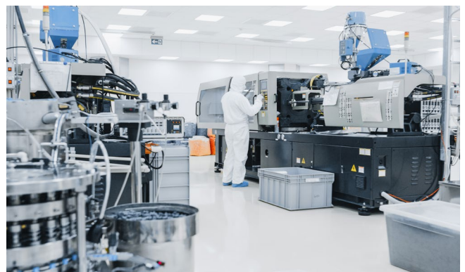
Additive manufacturing lab. Additive Engineers work with 3D printing technologies to produce new and creative objects.

Images in this document have been supplied by Manufacturing Skills Queensland and industry partners. Additional images have been sourced through Adobe Stock or generated using Adobe and Google AI software. Design layout by Liveworm, Queensland College of Art and Design, Griffith University.