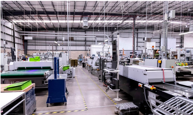
Clean high-volume printing facilities with equipment and machinery for the graphic printing industry.