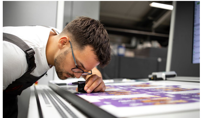
Printing technician proof-checking print quality before production run.