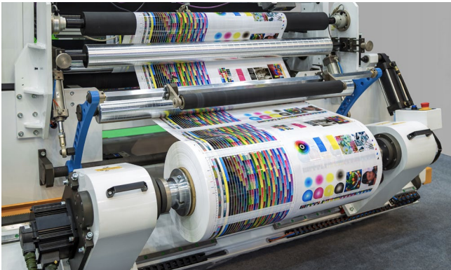
Large offset printing press running a continuous roll of paper in production.