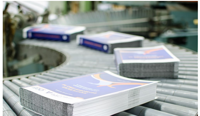
Printed books transported through facility on conveyor system.