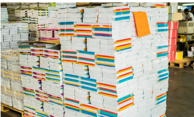
Printed materials awaiting distribution in manufacturers store facility.